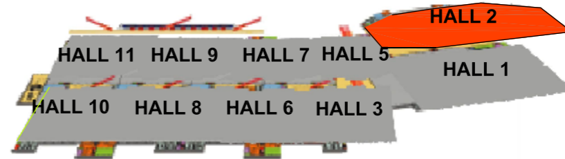
AsiaWorld-Expo Exhibition Hall Location 亞洲國際博覽館位置圖